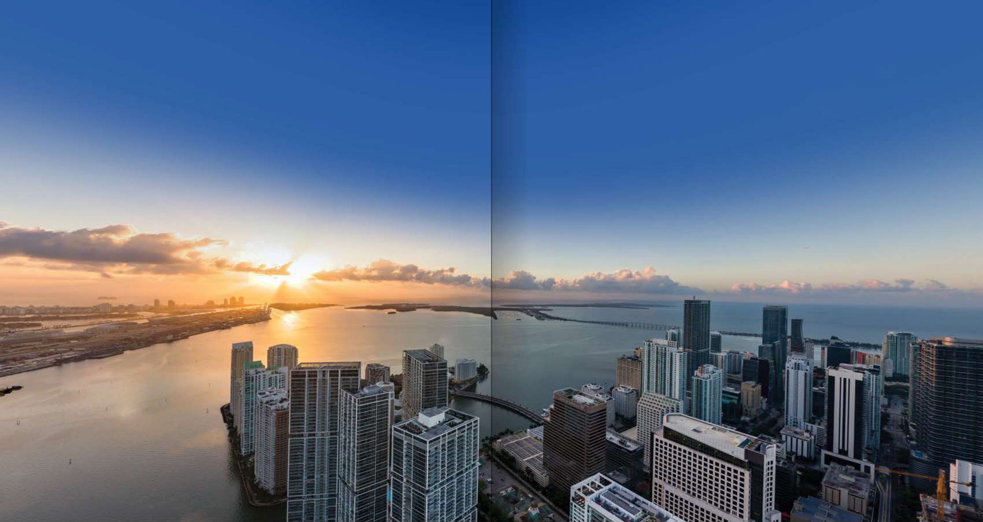
View at Sunrise