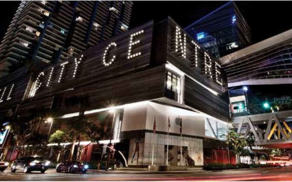
BRICKELL CITY CENTRE

The private marina, planned riverside restaurant and lushly landscaped river promenade invite residents to spend hours and days luxuriating in the infinite energy and organic sparkle of life by the water. Watch the superyachts come and go, take a sunset stroll towards the bay, or head to a number of chic waterside restaurants courtesy of our private water taxi service. Residents can enjoy private membership and exclusive access to the Beach Club at 1 Hotel South Beach, SH Hotels & Resorts sister property. With loungers, beach towel services, cabanas, and seaside snack and beverage services, this waterfront community will cater to leisurely hours under the sun. Take a break from the hustle and bustle of the city and unwind with a cool drink in hand and the sand between your toes. Perfectly positioned at the entrance of Brickell Avenue, where the Miami River meets the beautiful blue waters of Biscayne Bay, and the bustling financial district blends with high-end shopping, top restaurants, cultural hot spots and exciting nightlife—this iconic neighborhood is an all-day all-night lifestyle destination, aptly named the Manhattan of the South.