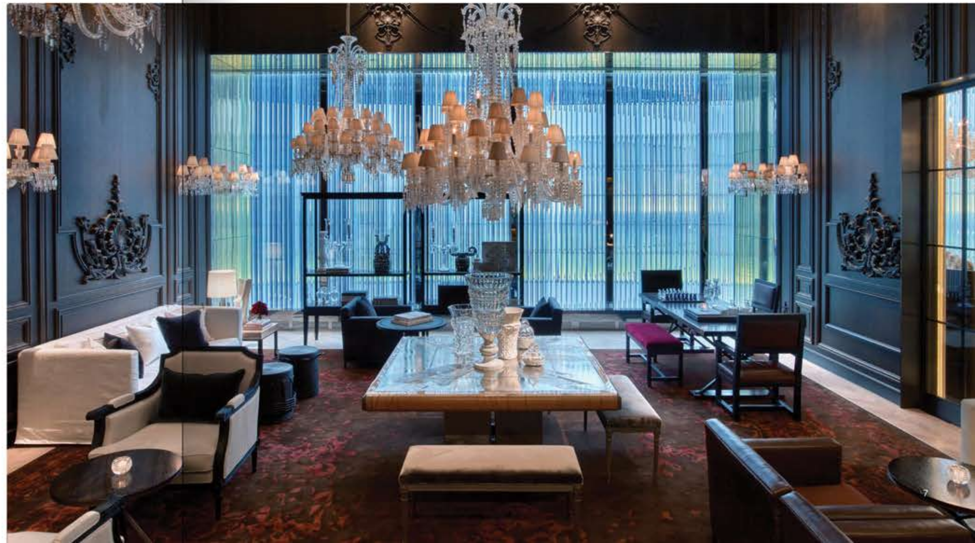
BACCARAT RESIDENCES MIAMI