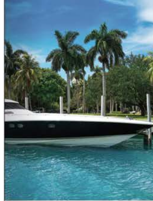
PRIVATE RESIDENTS' WATER TAXI

The private marina, planned riverside restaurant and lushly landscaped river promenade invite residents to spend hours and days luxuriating in the infinite energy and organic sparkle of life by the water. Watch the superyachts come and go, take a sunset stroll towards the bay, or head to a number of chic waterside restaurants courtesy of our private water taxi service. Residents can enjoy private membership and exclusive access to the Beach Club at 1 Hotel South Beach, SH Hotels & Resorts sister property. With loungers, beach towel services, cabanas, and seaside snack and beverage services, this waterfront community will cater to leisurely hours under the sun. Take a break from the hustle and bustle of the city and unwind with a cool drink in hand and the sand between your toes. Perfectly positioned at the entrance of Brickell Avenue, where the Miami River meets the beautiful blue waters of Biscayne Bay, and the bustling financial district blends with high-end shopping, top restaurants, cultural hot spots and exciting nightlife—this iconic neighborhood is an all-day all-night lifestyle destination, aptly named the Manhattan of the South.