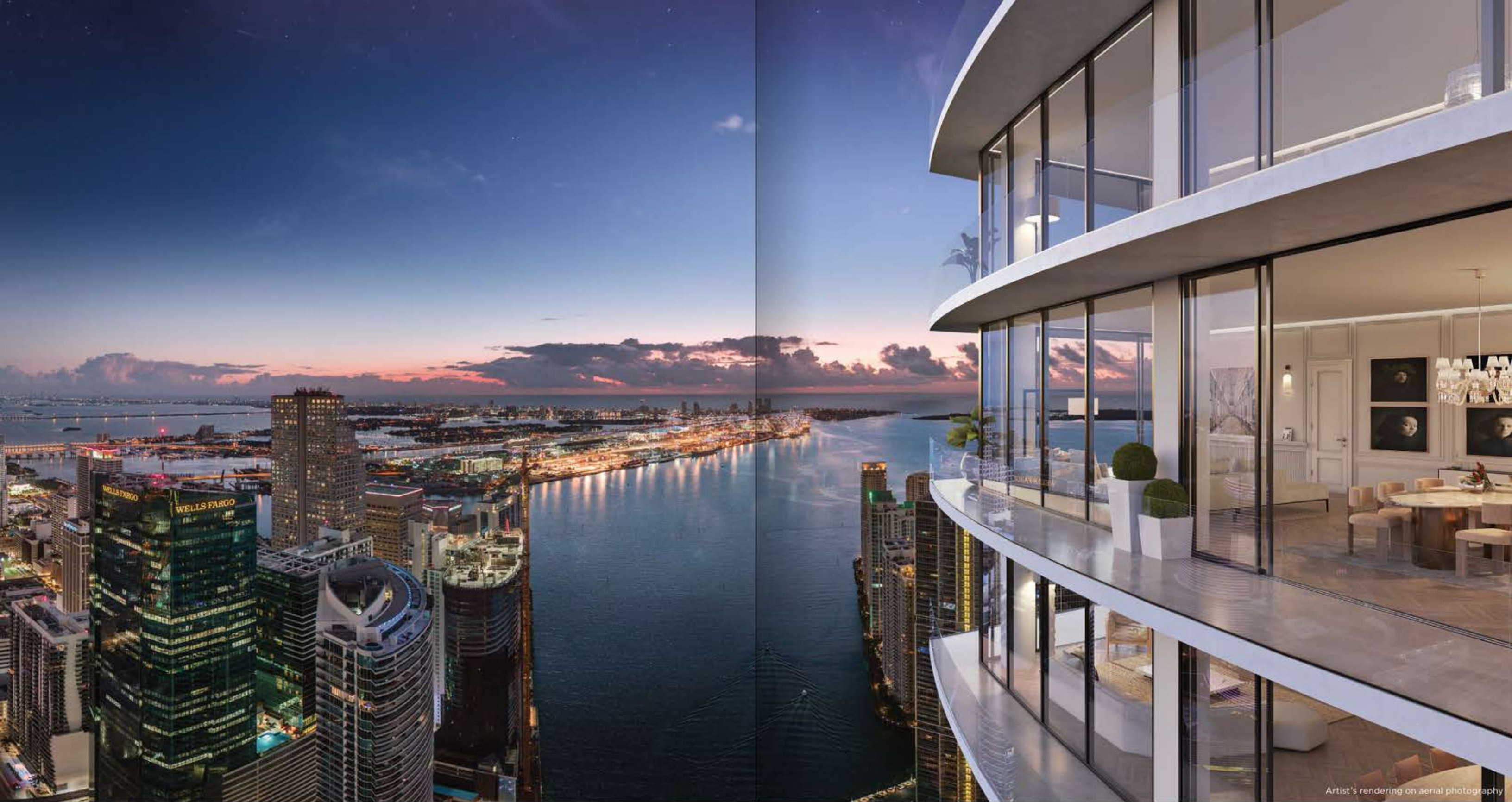
Artist's rendering on aerial photography

Expansive private terraces accessible from the great room and master bedroom of every residence, and wrap around terraces at corner units, with glass railings for unobstructed views.