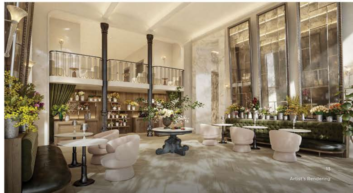
LOBBY CAFÉ AND FLOWER SHOP