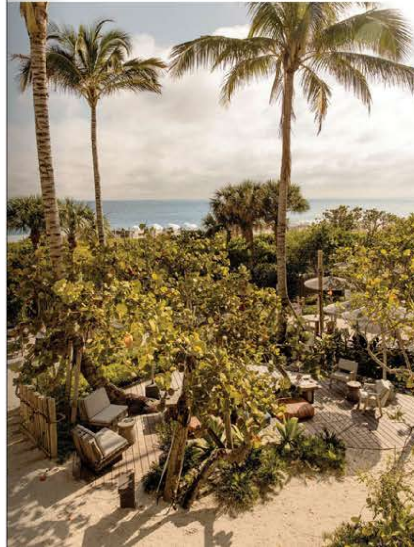
BEACH CLUB AT 1 HOTEL SOUTH BEACH