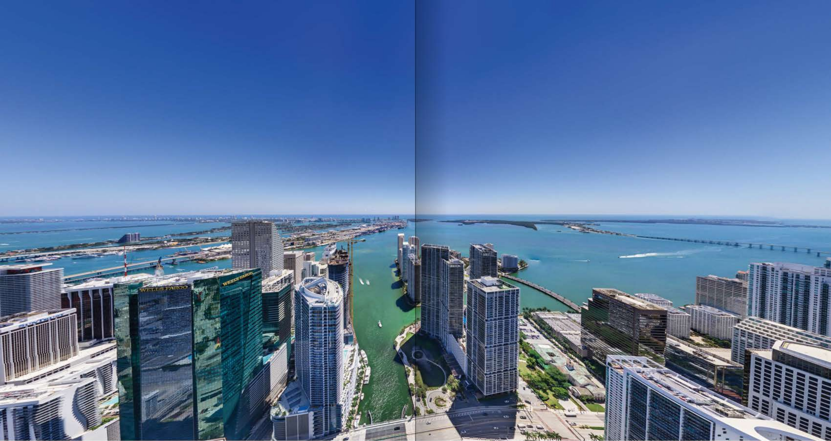
View at Daytime