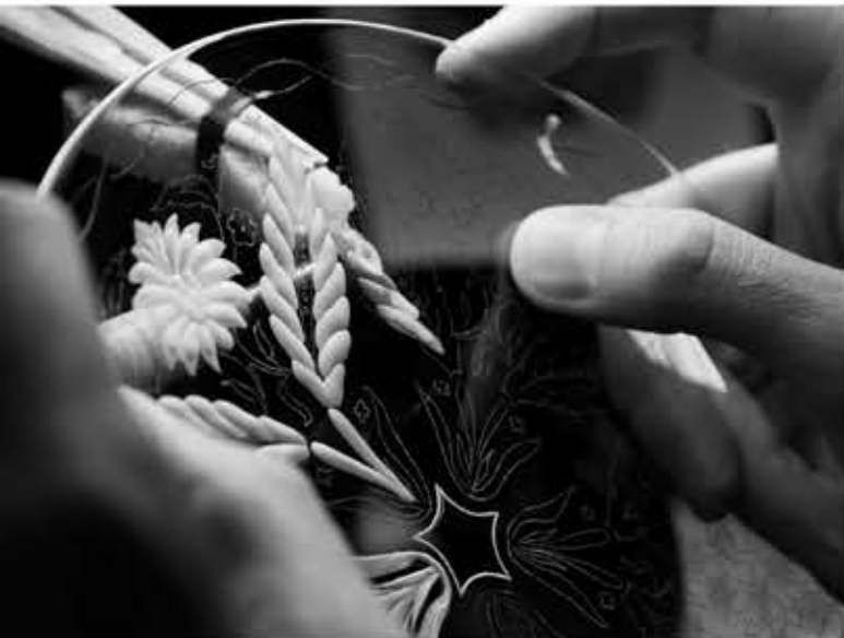
THE BACCARAT FACTORY