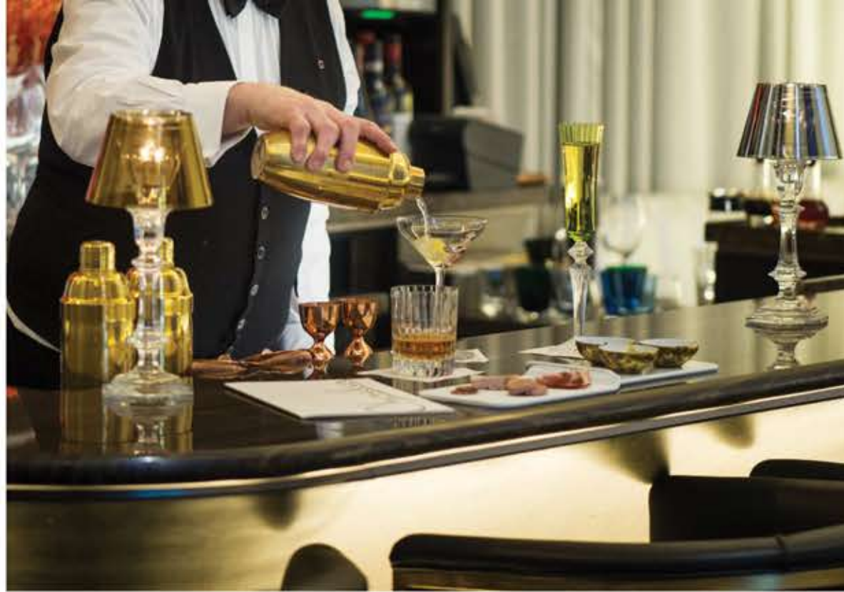
BACCARAT HOTEL NEW YORK

Today, Baccarat continues to celebrate light with shimmering, sensual, and elegant qualities. For over 250 years, Baccarat has pursued and achieved perfection in creating crystal masterpieces. Pushing its heritage of craftsmanship forward, Baccarat creates inspiring architecture and brilliant design, paired with the highest-quality service, to make the finest residences in the world.