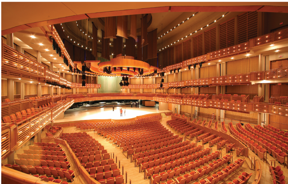
ADRIENNE ARSHT CENTER FOR THE PERFORMING ARTS OF MIAMI

A pair of glass towers with flowing design profiles rises high above Miami's chic Edgewater neighborhood. Directly on the shores of Biscayne Bay and surrounded the bustling Downtown and Brickell city centers, Design District, Wynwood, Midtown, and Miami Beach. Aria Reserve is immediately recognizable, yet feels like a private estate hidden away from the rest of the world.