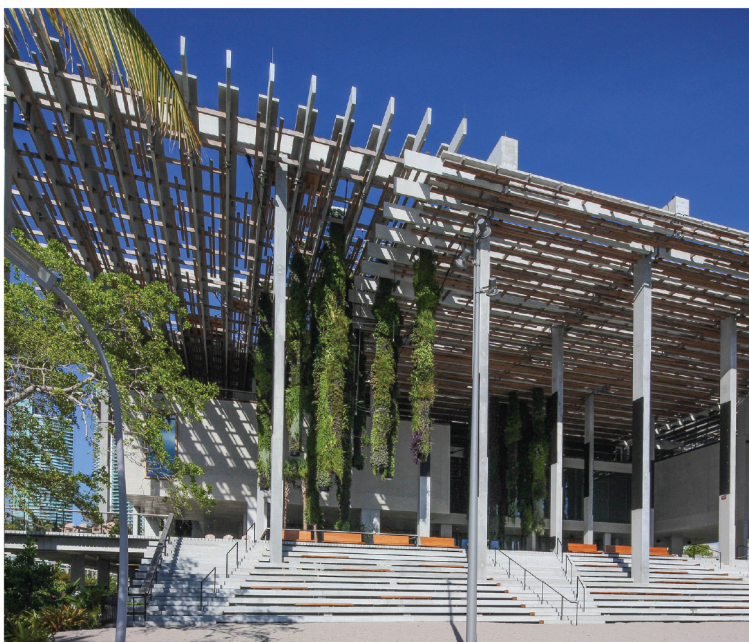
PÉREZ ART MUSEUM MIAMI