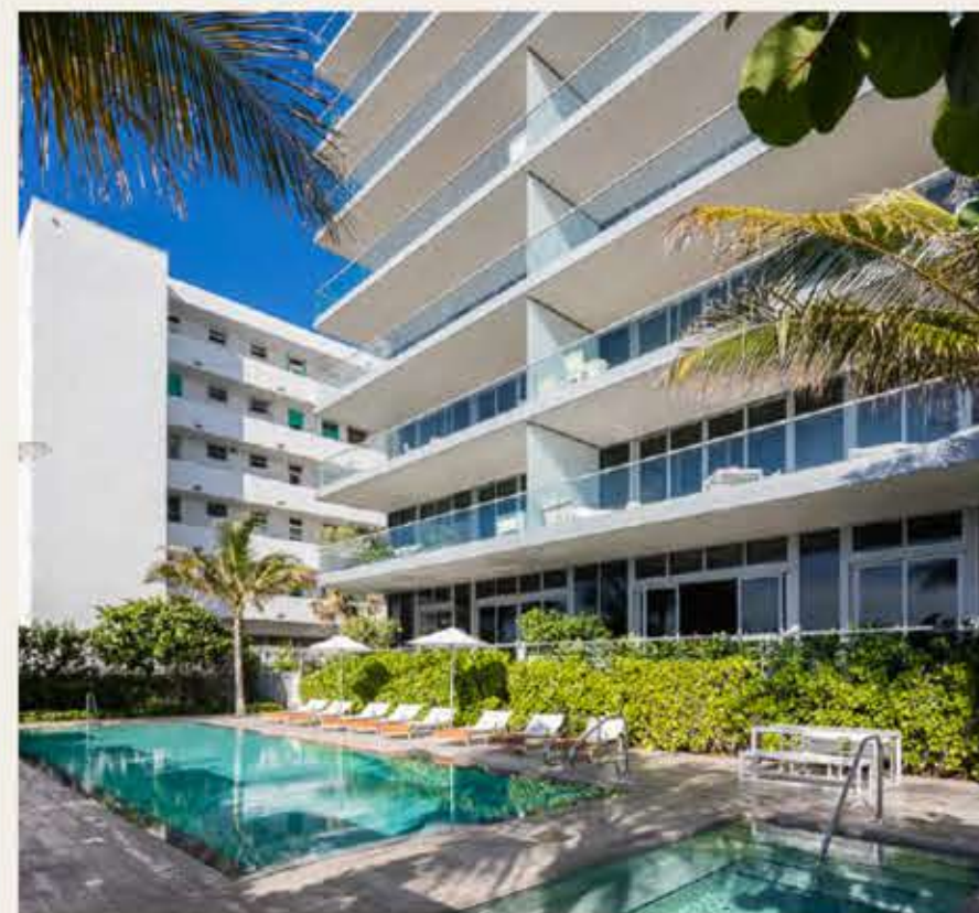
465 PACIFIC ST.