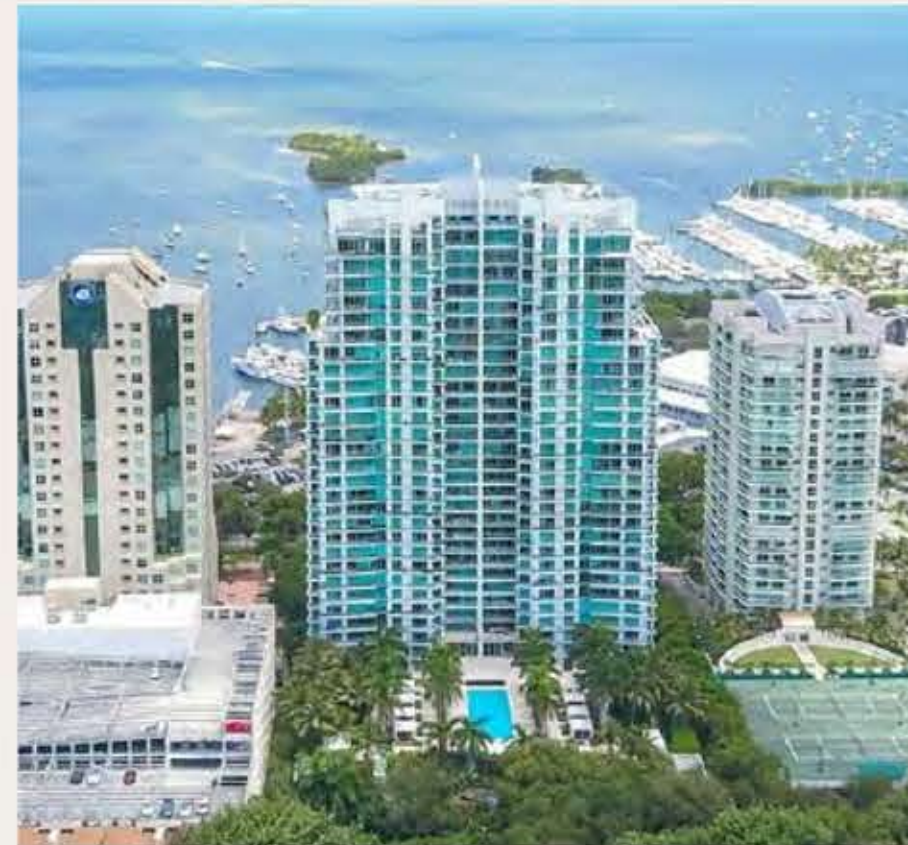
GROVENOR HOUSE, COCONUT GROVE