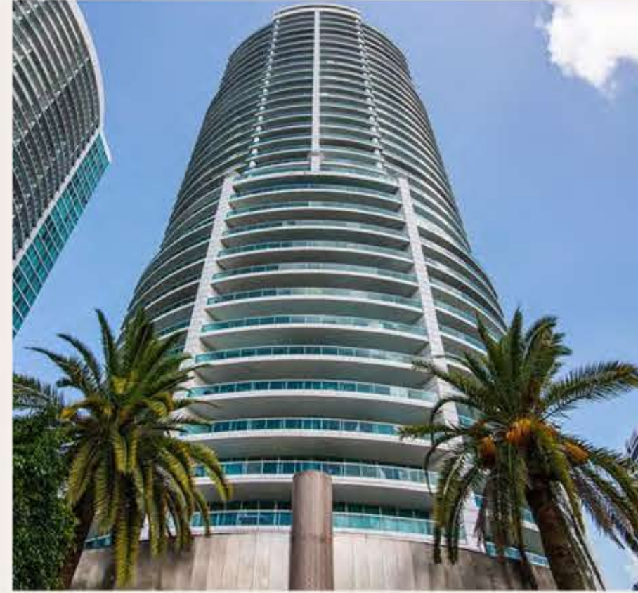
THE BRISTOL TOWER, BRICKELL