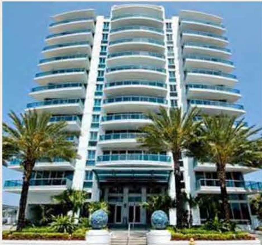
THE AZURE, SURFSIDE