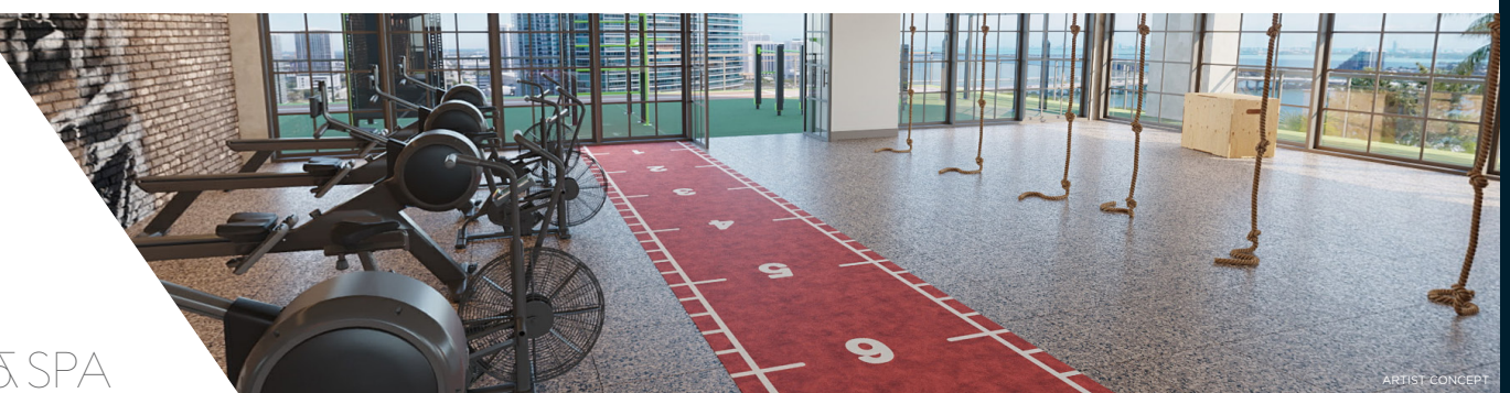
HEALTH AND FITNESS CENTER, AIMED AT NOURISHING BODY & SOUL.