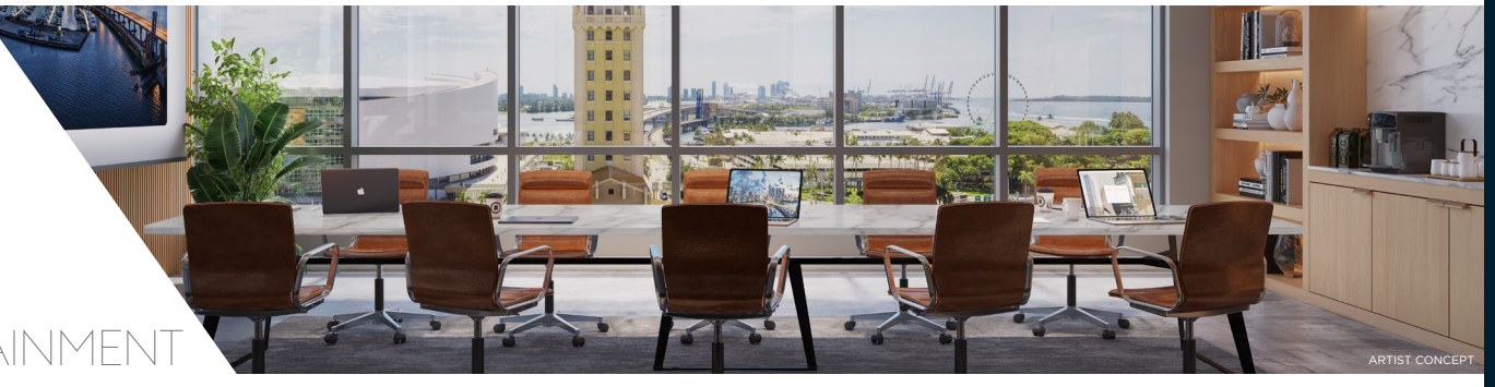
30,000 SQ FT PRIVATE EVENT AND MEETING SPACES