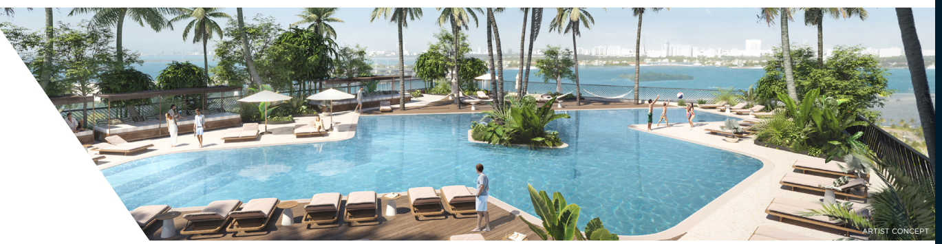
16,000 SQ FT POOLSIDE RETREAT ELEVATED ABOVE THE HUM OF DOWNTOWN