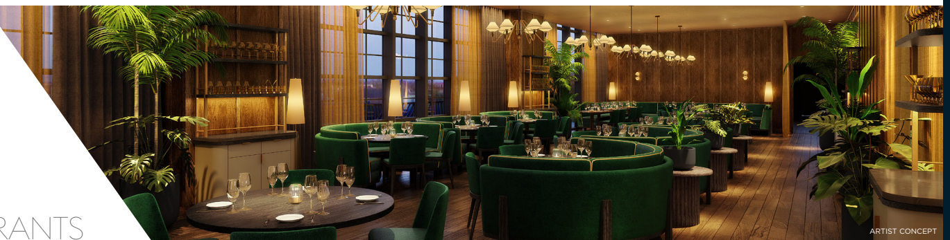
24,000 SQ FT OF INVIGORATING FOOD & BEVERAGE OFFERINGS FOCUSED ON LOCAL FARE