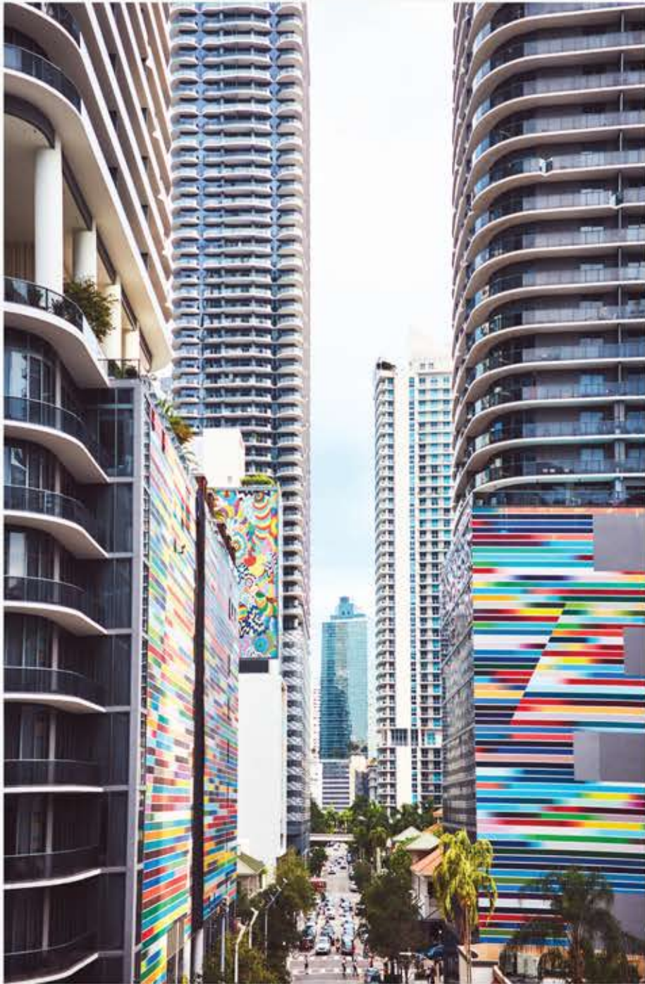
Miami Design District

Miami is a city unafraid of possibility. From its legendary beaches to the dynamic arts scene, Miami embodies innovation, vibrant energy and multiculturalism. This sprawling metropolis blends its tropical paradise vibe with cutting-edge urban living, making it a magnet for dreamers, doers and everyone in between.