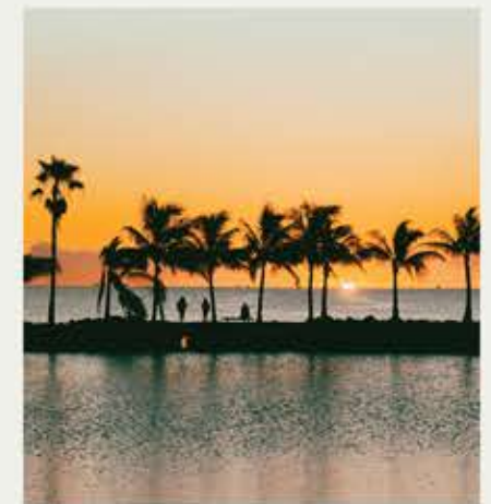
11. Matheson Hammock Park & Marina

Coral Gables was first imagined in the early 1900s by its founder, George E. Merrick, as a “City Beautiful” and “Garden City,” with tree-lined avenues, historic monuments, civic landmarks, winding roads, abundant green spaces, and Mediterranean Revival architecture. Today, Coral Gables is a vibrant, sophisticated sanctuary of exceptional restaurants, galleries, shopping, top private schools, expansive natural beauty, and a considered, refined way of life.