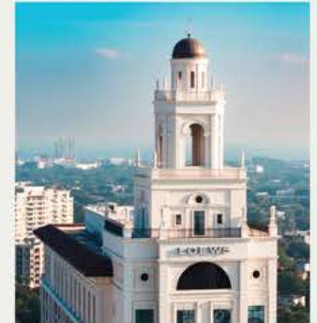
4. The Plaza Coral Gables