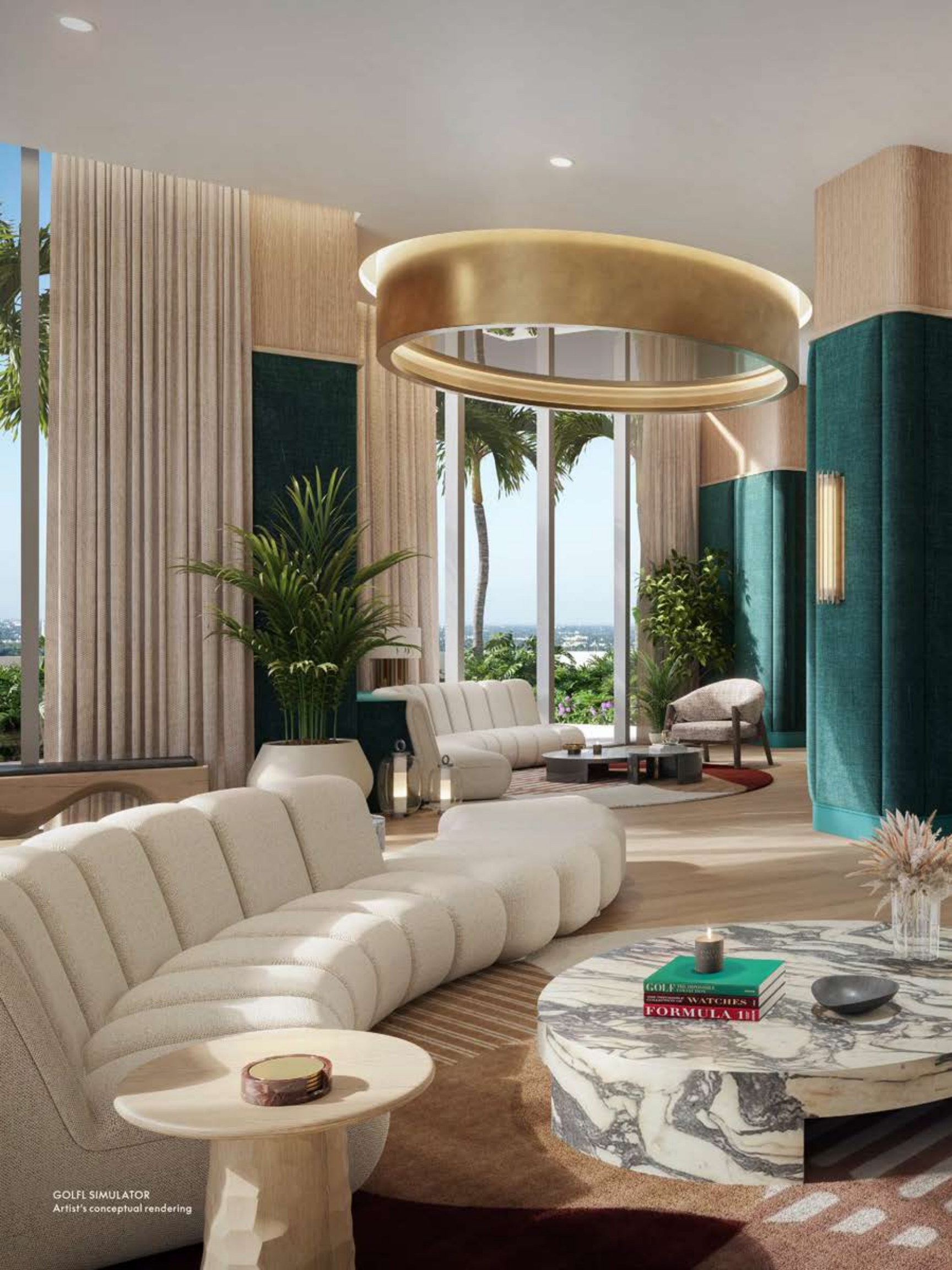
GOLF SIMULATOR Artist's conceptual rendering