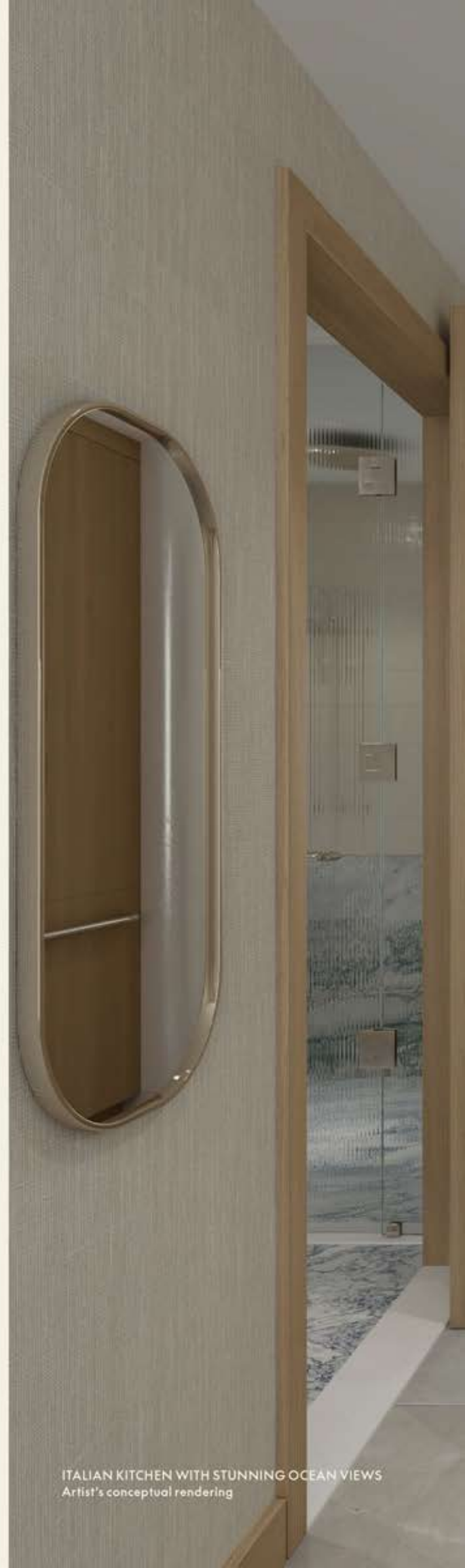
ITALIAN KITCHEN WITH STUNNING OCEAN VIEWS Artist's conceptual rendering