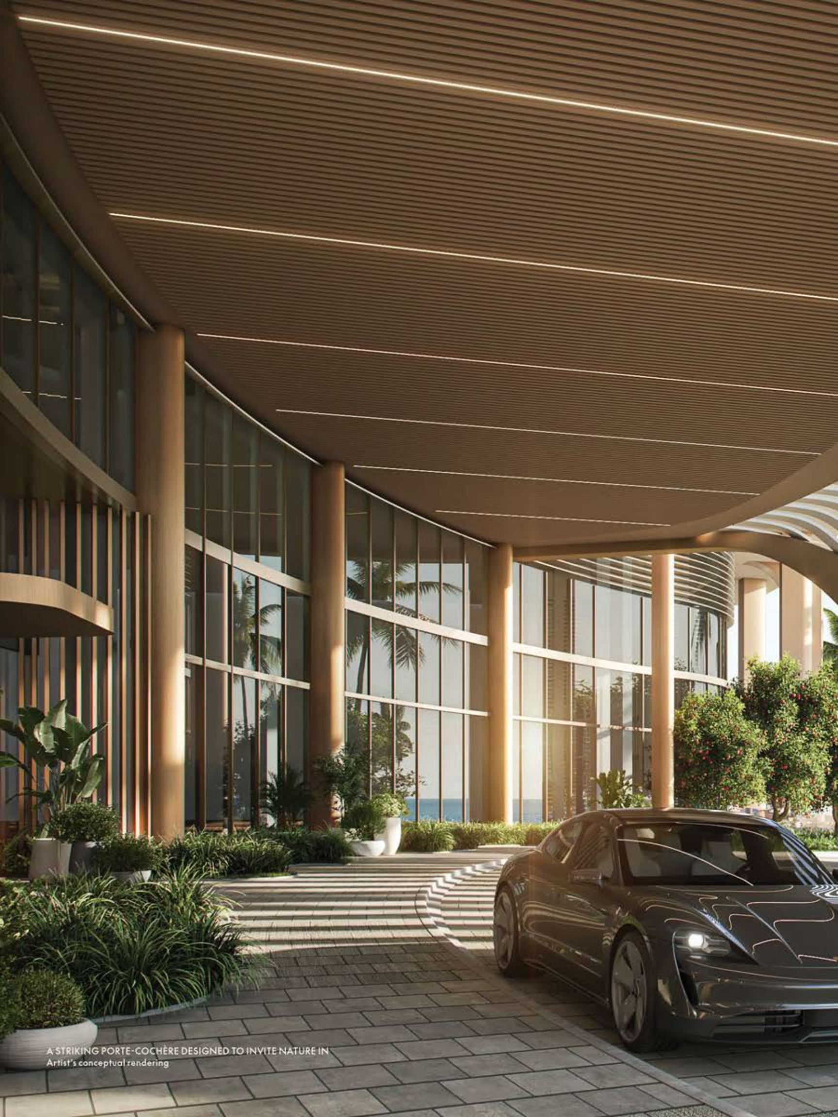
A STRIKING PORTE-COCHÈRE DESIGNED TO INVITE NATURE IN Artist's conceptual rendering