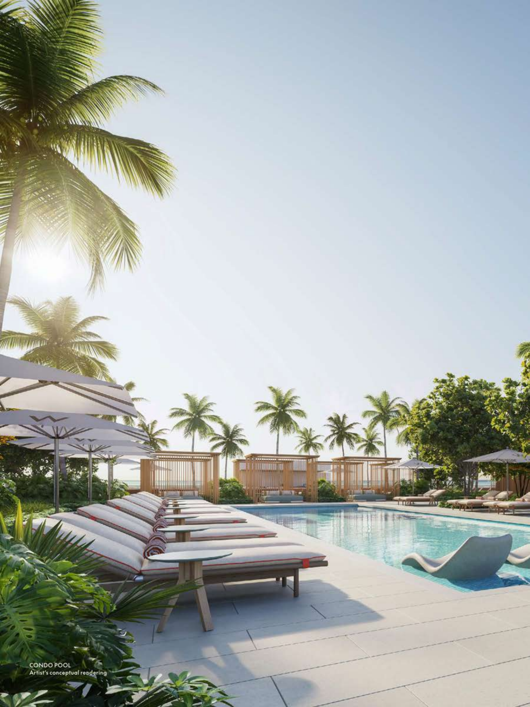
CONDO POOL Artist's conceptual rendering