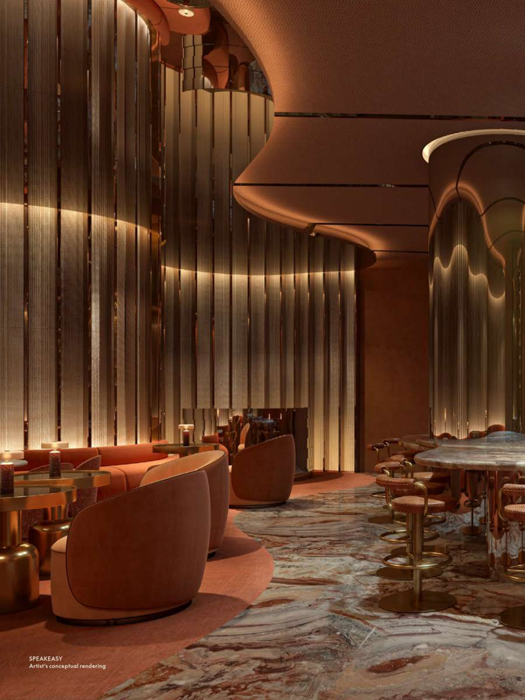
SPEAKEASY Artist's conceptual rendering