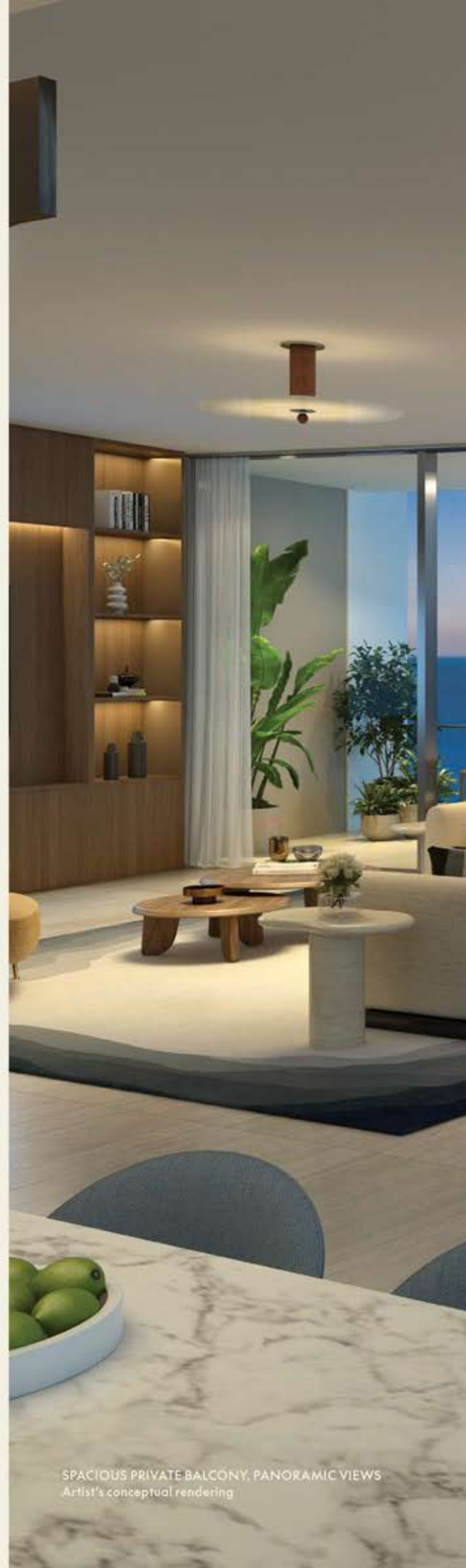
SPACIOUS PRIVATE BALCONY, PANORAMIC VIEWS Artist's conceptual rendering