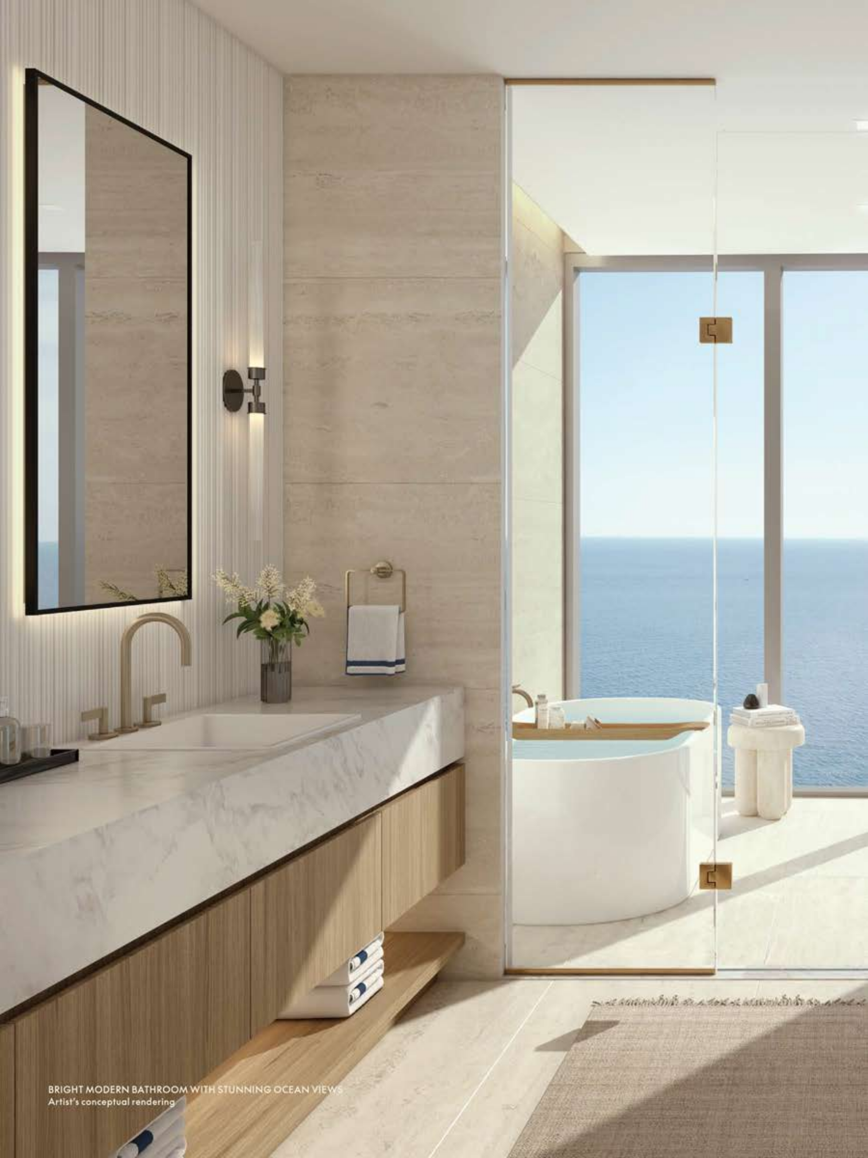
BRIGHT MODERN BATHROOM WITH STUNNING OCEAN VIEWS Artist's conceptual rendering