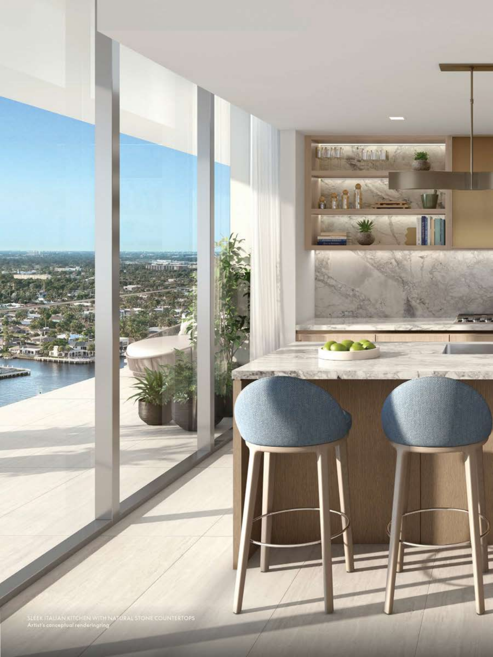
5LEEK ITALIAN KITCHEN WITH NATURAL STONE COUNTERTOPS Artist's conceptual rendering