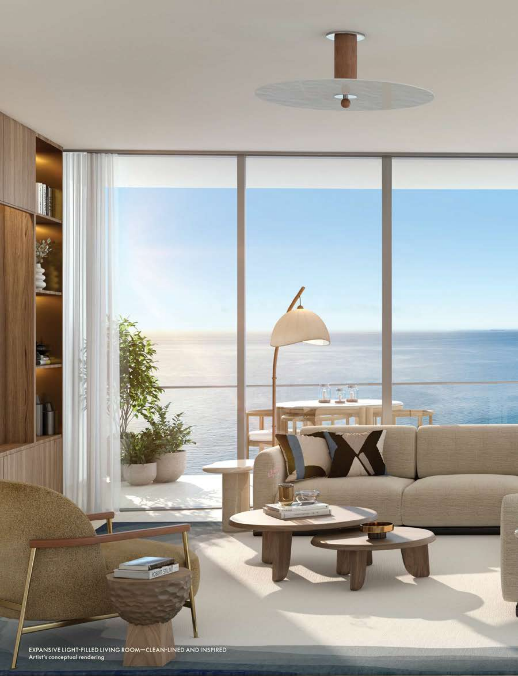
EXPANSIVE LIGHT-FILLED LIVING ROOM—CLEAN-LINED AND INSPIRED Artist's conceptual rendering