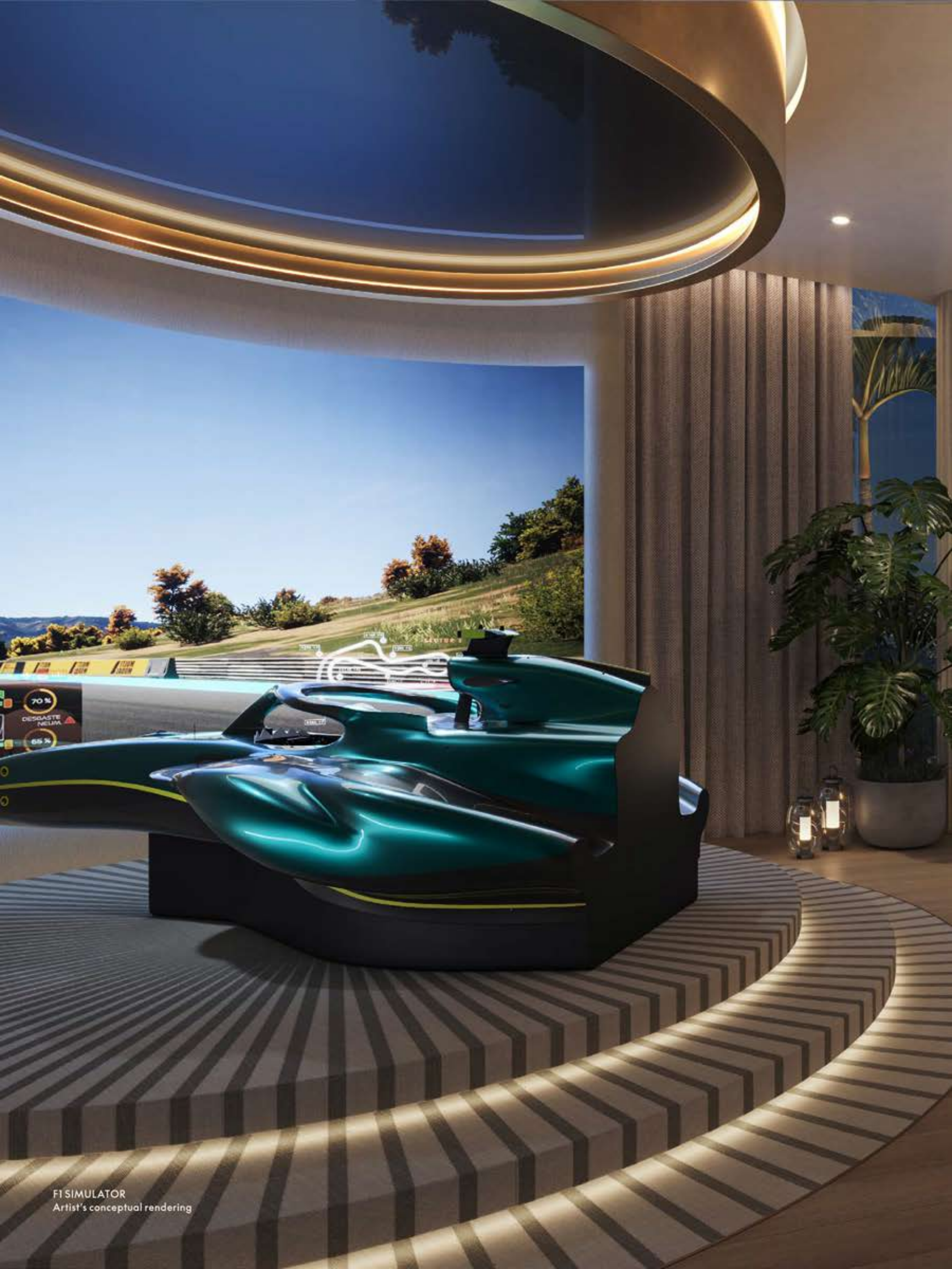
F1 SIMULATOR Artist's conceptual rendering