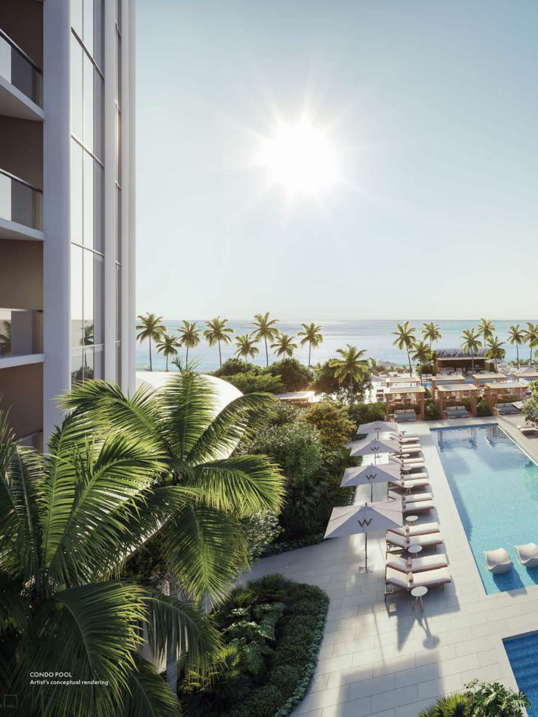
CONDO POOL Artist's conceptual rendering