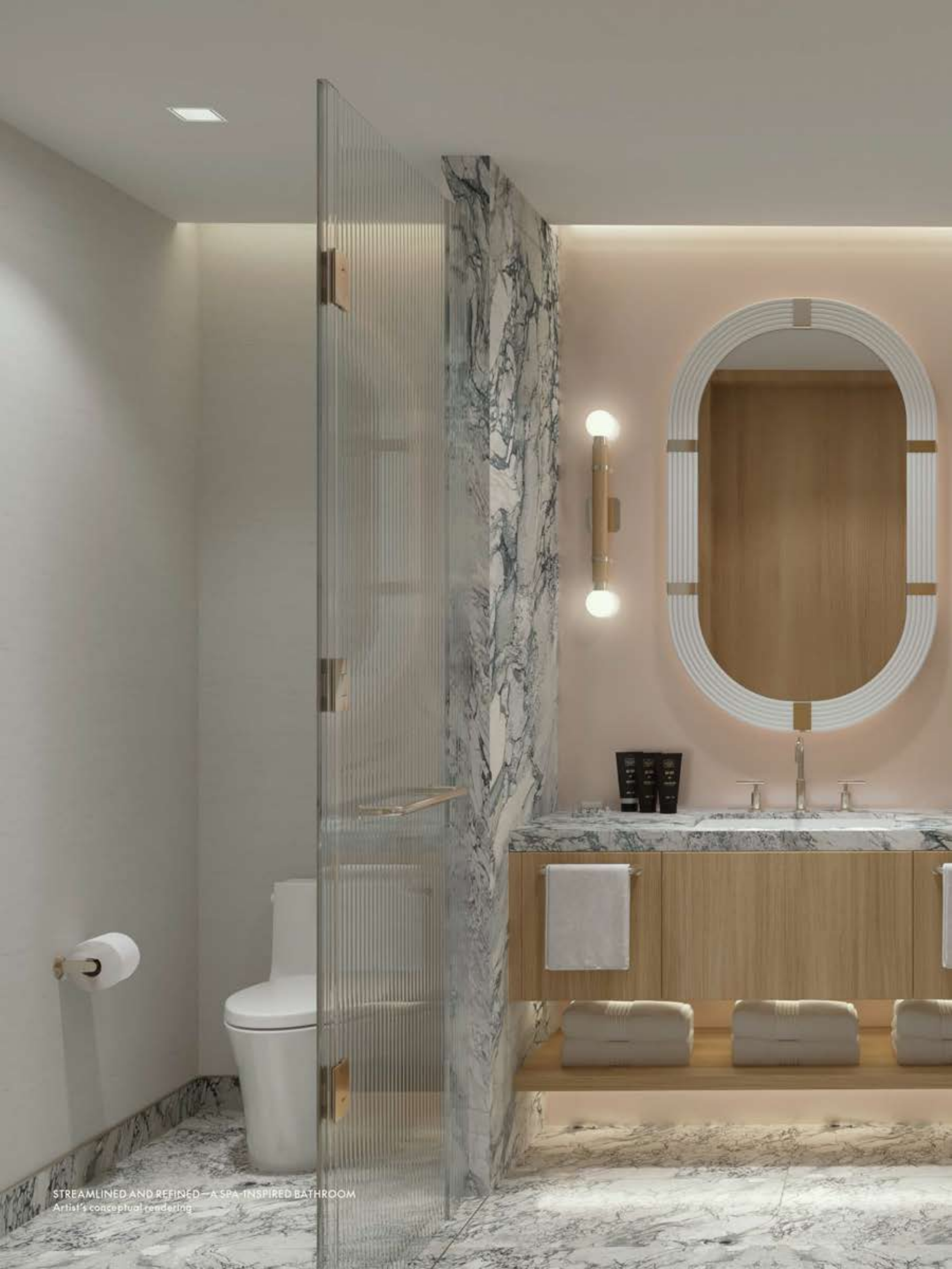
STREAMLINED AND REFINED — A SPA-INSPIRED BATHROOM Artist's conceptual rendering